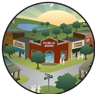
Mendocino County Vision