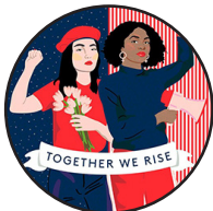
Candidates & Elections