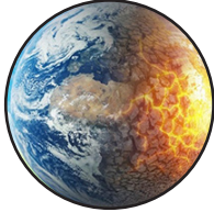
Climate Crisis Action